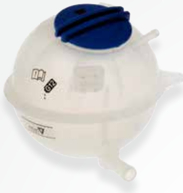
603-350 VW Beetle 2010-98