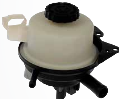
603-934 2007-01 Chrysler Caravan, Grand Caravan, Town & Country, Voyager