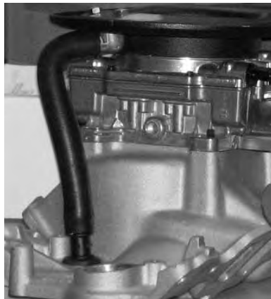
Breather Hose Sample Installation