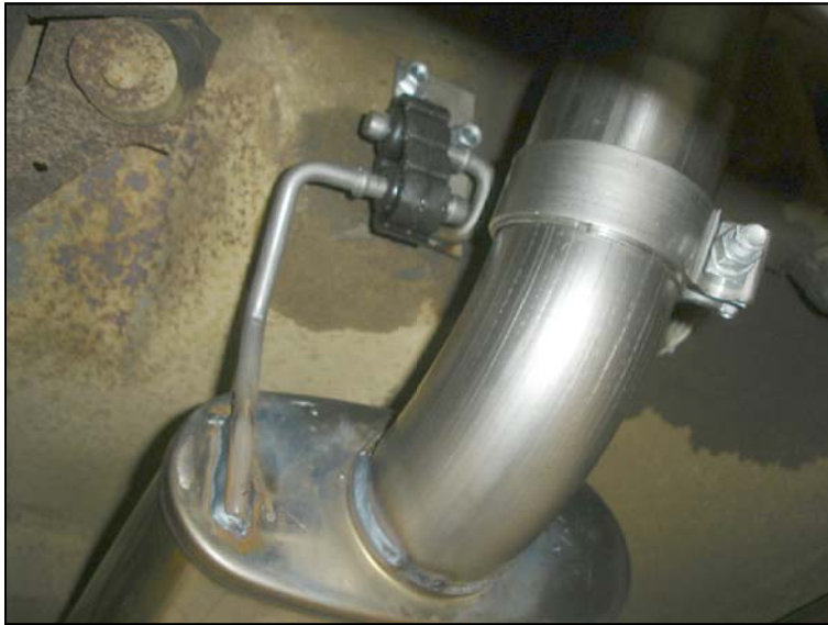
Fig. # 1

Step 5: Slip the over axle pipes over the muffler assembly outlet pipes. Secure with the supplied clamps.