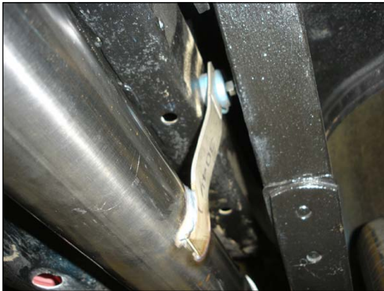
Fig. # 2

Step 7: Once a final position has been chosen for the new system, evenly tighten all fasteners from front to rear. Inspect all fasteners after 25-50 miles of operation and retighten if necessary.