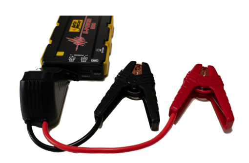
Cables Module Illustration 3

Before using the E-Power, make sure that it is fully charged. This unit is charged through the USB-C port. A 12" long charging cord is included. One end with USB-C to plug into the E-Power ( to the port labeled In(Out)), and the other end is USB-A that you can plug into a cell phone charger port, a USB port in a vehicle, or a computer USB port.