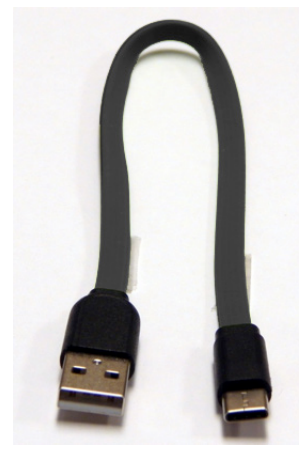
Charging Cord Illustration 2

Before using the E-Power, make sure that it is fully charged. This unit is charged through the USB-C port. A 12" long charging cord is included. One end with USB-C to plug into the E-Power ( to the port labeled In(Out)), and the other end is USB-A that you can plug into a cell phone charger port, a USB port in a vehicle, or a computer USB port.