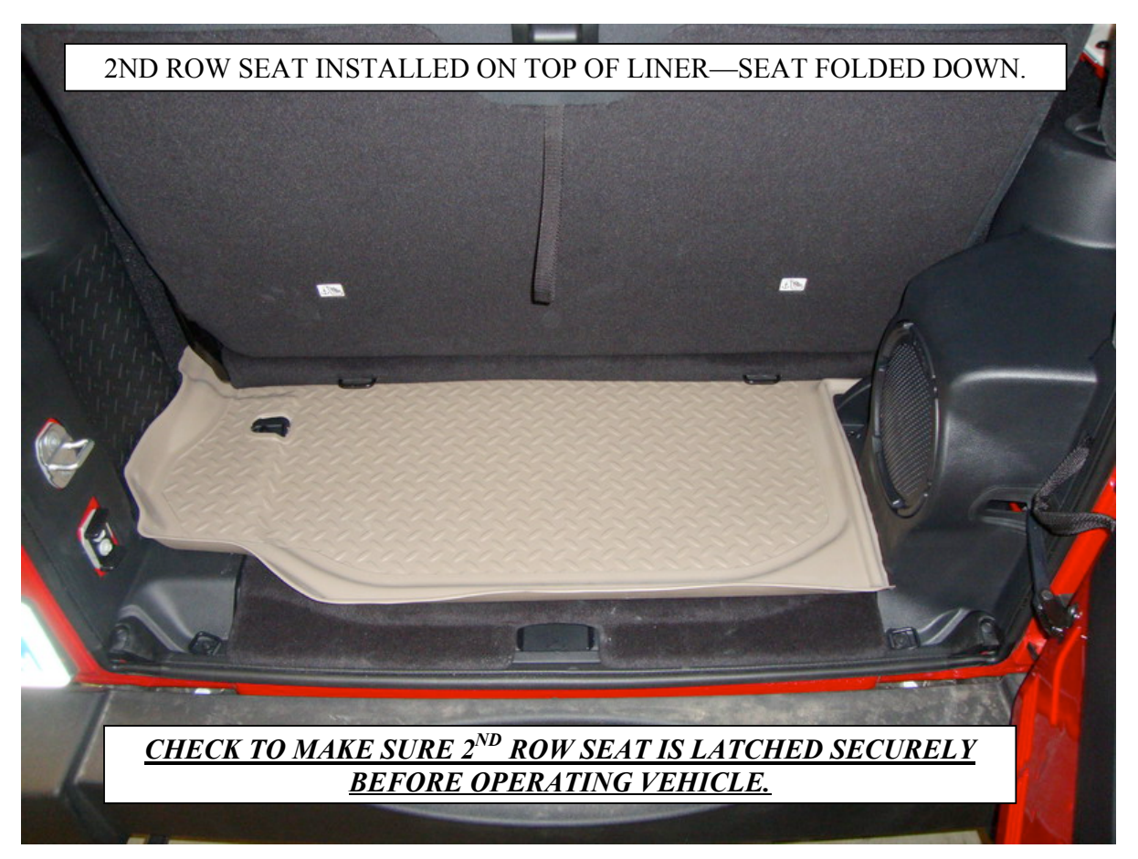
HUSKY LINERS PRODUCT WARRANTY

Husky Liners guarantees to the original purchaser of Husky Liners products that they will not break or tear under normal usage during the life of the motor vehicle in/on which they are installed. This warranty shall only be effective while the original purchaser owns the motor vehicle and shall not apply to Husky Liners products that have been removed from the original vehicle on which they were installed. This warranty applies only to those parts that are correctly installed in/on the vehicle for which they were intended.