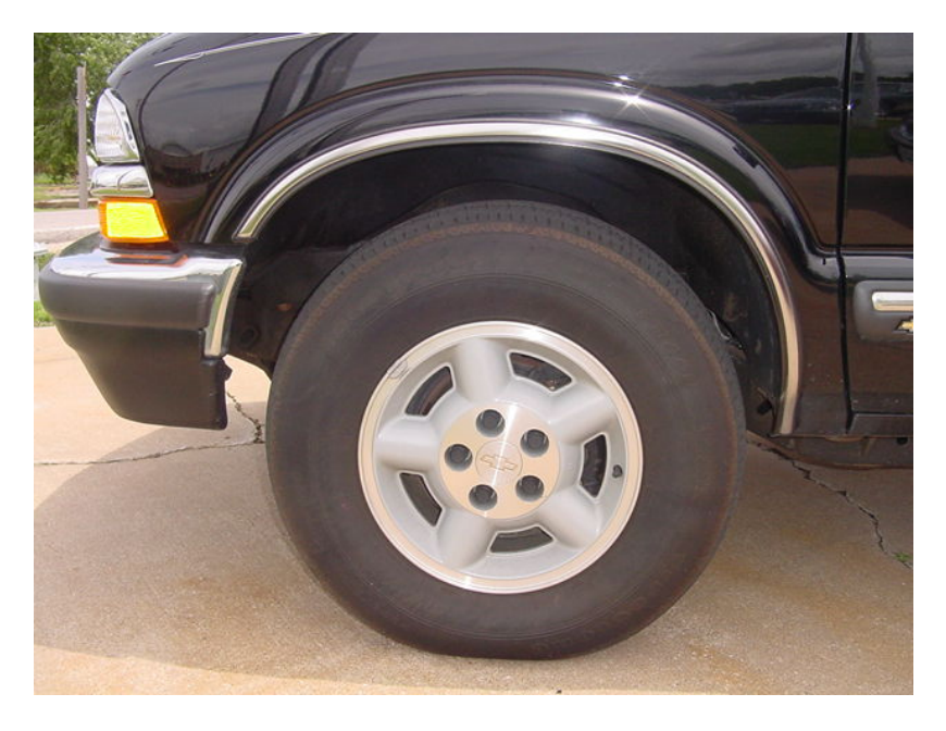
IF VEHICLE HAS FRONT FENDER TRIM MOLDING AS SHOWN ABOVE USE PART NO. 5627

THE 5629 MUD GUARD WILL NOT WORK WITH FENDER TRIM MOLDING OR BODY CLADDING AS SHOWN BELOW: