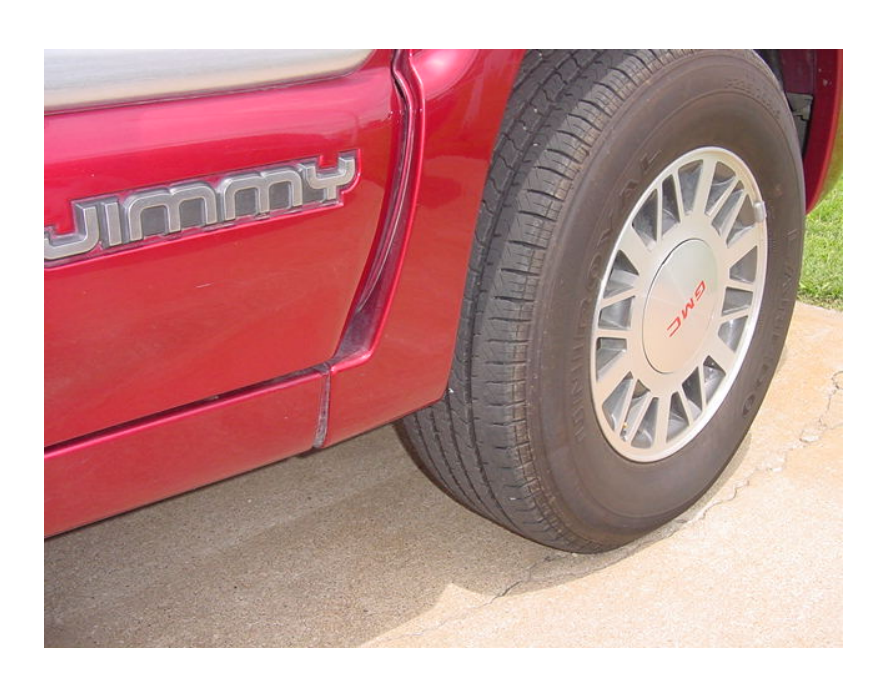
PART NO. 5629 OR 5627 WILL NOT WORK FOR VEHICLES WITH BODY CLADDING OR FENDER FLARES.