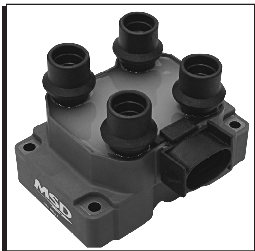
Figure 1 The MSD Ford 4- Tower Coil Pack.

WARNING: High Voltage is present on the coil terminals. DO NOT touch the coil terminals or tower when the engine is cranking or running.