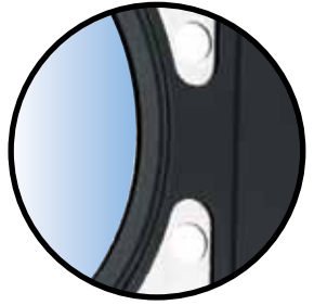
Unique application-specific coating enhances sealability.

Full-hard stainless steel material maintains its shape despite thermal expansion and "scrubbing" between block and head.