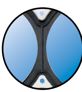
Where applicable, extra-strong "stopper" layer provides superior primary combustion seal.