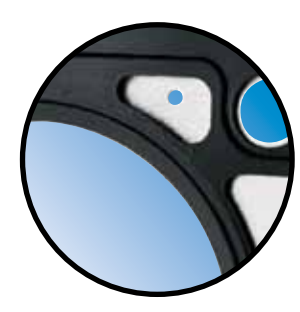
Strategically placed sealing beads eliminate leak paths.