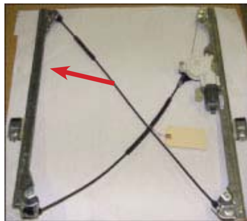
Replacement Part Does Not Have 3rd Mounting Bracket