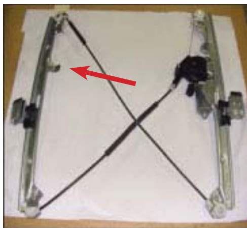
Original Equipment Has 3rd Mounting Bracket