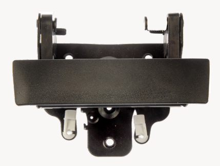
Tailgate Handle Textured Black 80592

Chevrolet 2014-07, GMC 2014-07, Hummer 2010-09