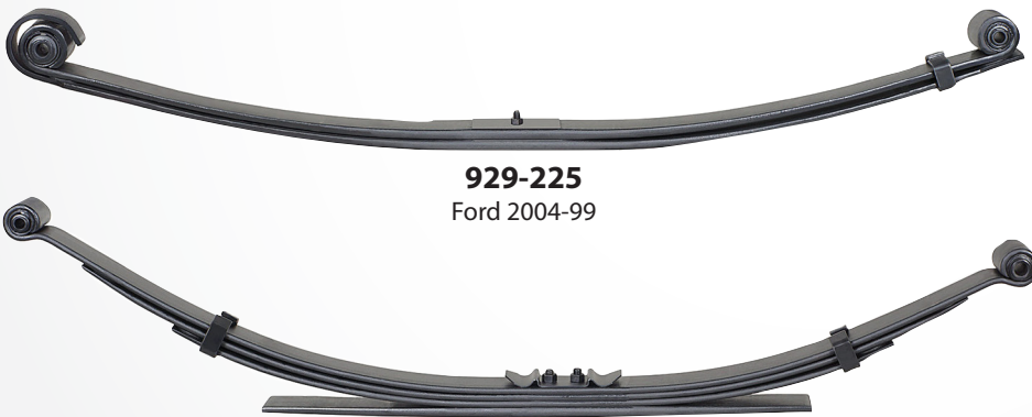
929-225 Ford 2004-99

Coverage Now Available for Popular Ford and Medium Duty Vehicles