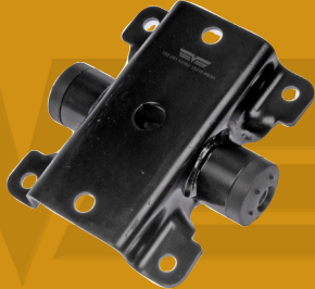
722-081 Chrysler, Dodge Minivan 2007-01