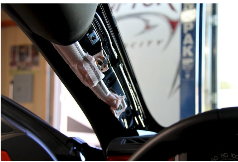
4. Original A-Pillar removed.

3. There is a safety strap that needs to be removed to pull the pillar away. The screwdriver is pressing into the point where it is released in this picture.