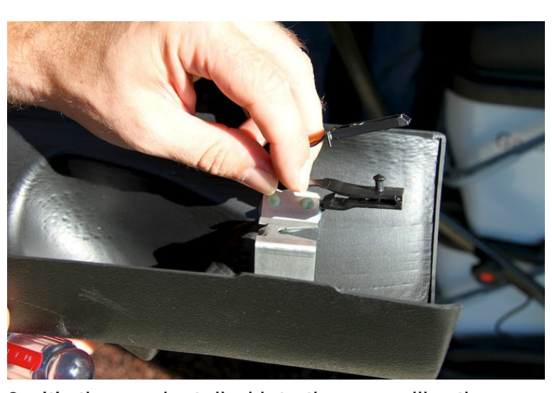
6. It's then re-installed into the new pillar the exact same way.

7. Install and wire gauges according to the wiring instructions included with each gauge.