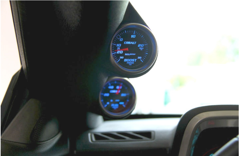
9. The completed installation.