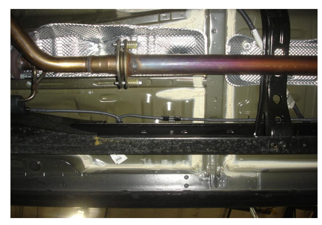
Step 1. Begin removal of the OEM exhaust system by unbolting the two spring loaded bolts attaching the exhaust to the catalytic converter. Do not discard or damage the OEM fasteners or rubber insulators as they will be used to install the new system.