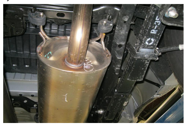
Step 2. Disengage hangers from rubber insulators and remove the OEM exhaust.