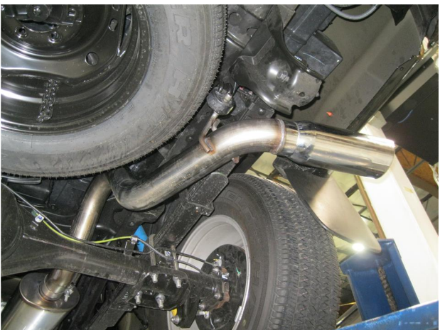
Step 4. Next use the supplied 2.50" clamp to attach the Muffler Assembly to the Inlet Pipe. Finish by attaching the Tailpipe Assembly to the Muffler Assembly with the Supplied 3.00" clamp and fitting the hangers into the insulators.