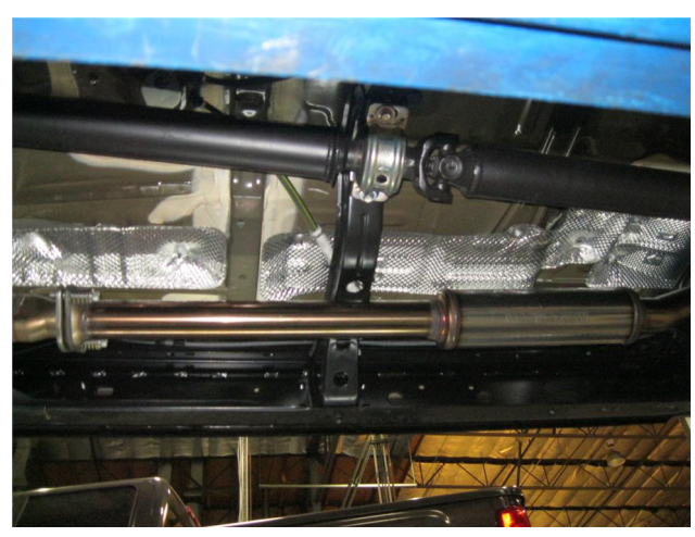
Step 3. Begin installation of your new MAGNAFLOW system by attaching the Resonater Assembly to the catalytic converter outlet using the OEM fasteners and insulator. Keep all fasteners and clamps loose until final adjustment.