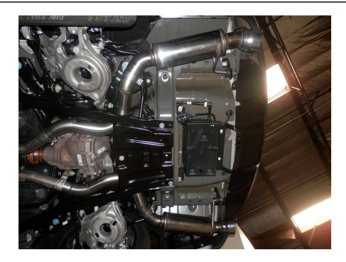
Step 3. Next attach both Muffler Assemblies to the Inlet Pipe Assemblies using the supplied 3.00" clamps and fitting the hangers into the rubber insualtors.