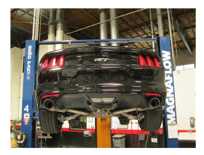
Step 4. Once a final position has been chosen for the new exhaust system, evenly tighten all clamps from front to rear using the torque specifications on page one of the instructions. Inspect all fasteners after 25-50 miles of operation and re-tighten if necessary.

MAGNAFLOW: 22961 Arroyo Vista - Rancho Santa Margarita, CA 92688 | 1(800) 990-0905 Technical Support: 1(800) 959-9226 | Email: moreinfo@magnaflow.com