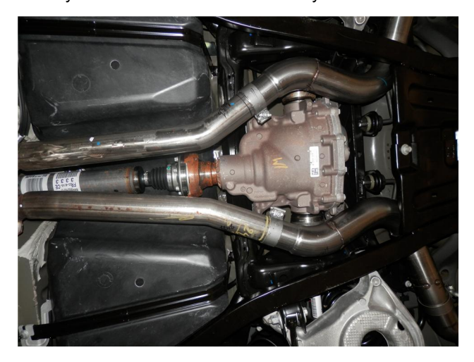
Step 2. Begin installation of the new system by attaching both Inlet Pipe Assemblies to the pipes you have just cut. Loosely secure using the supplied 2.50" clamps. Engage the welded hangers to the rubber insulators. Leave all clamps loose until final adjustment.

Step 1. Begin removing the OEM exhaust system by cutting both pipes exiting the resonator. Measure and cut 23.5" (driver side) and 24.5" (passenger side) from the rear of the resonator. Next, extract the hangers from the rubber insulators and remove the OEM mufflers. Retain insulators as they will be used to install the new system.