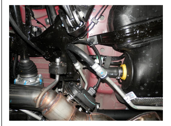
Step 6. To re-connect the wiring harness plugs to the Valve motors you may need to cut their plastic anchors. After having done this attach the plugs to the motors and re-anchor the wires with a supplied Zip Tie.