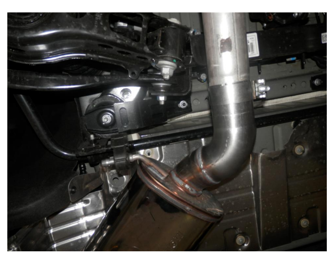
Step 4. Begin installation of the new system by sliding the D/S Muffler Assembly inlet onto the cut outlet of the OEM exhaust and loosely fasten with the supplied 2.75" clamp. Fit the hangers into the rubber insulators.