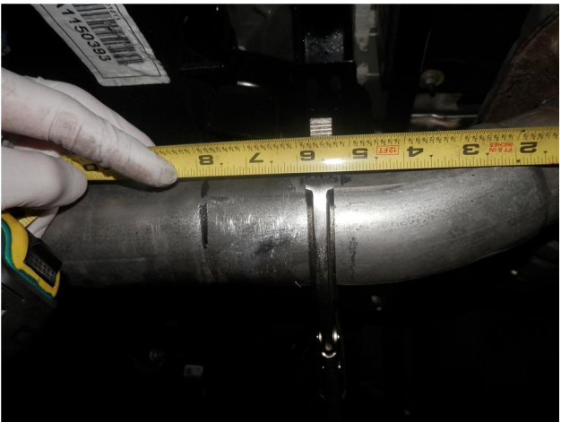
Step 1. It is necessary to cut the factory exhaust system to install the new Magnaflow unit. To do this measure 5.75" in front of the welds on the rear muffler inlets. Deburr the cut pipes to facilitate installation of the new system.