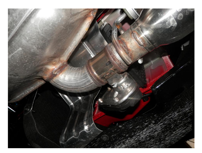
Step 2. Next you will need to unplug the electrical connection on the rear Exhaust Valve Control Motors (Qty 2) located on the OEM exhaust assembly.