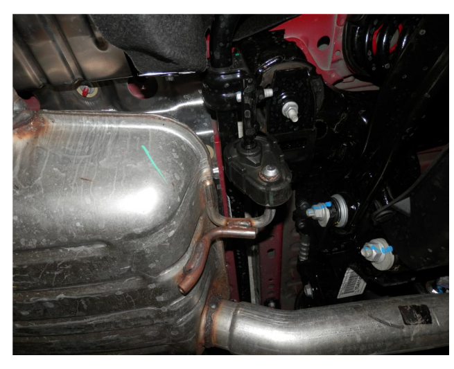
Step 3. Working front to rear disengage all welded hangers from the rubber insulators and remove the muffler assembly. (Retain the insulators as they will be needed to mount the new MAGNAFLOW system.) Once the OEM system is on the ground transfer both valve motors over to the new Magnaflow exhaust system using the OEM fasteners.