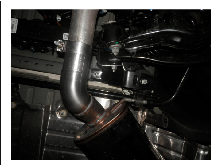
Step 5. Install the P/S Muffler Assembly in the same manner. Leave all clamps loose for final adjustment of the system.