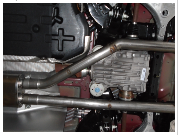
Step 4. Install the new Mid Pipes to the Muffler Assembly using the supplied clamps. Engage the welded hangers to the rubber insulators.

Step 3. Install the new Muffler Assembly to the Inlet Pipes using the supplied clamps. Engage the welded hangers to the rubber insulators.