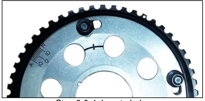
Step 3 & 4: Locate hole.

5. Using a No.7 or 13/64" drill bit, drill a through hole at the intersection of the angular and radial reference marks. This may be done with a hand drill, on the engine, or a drill press or mill, off the engine. It is advised to use a center-punch to help locate the drill bit prior to drilling the cam gear.