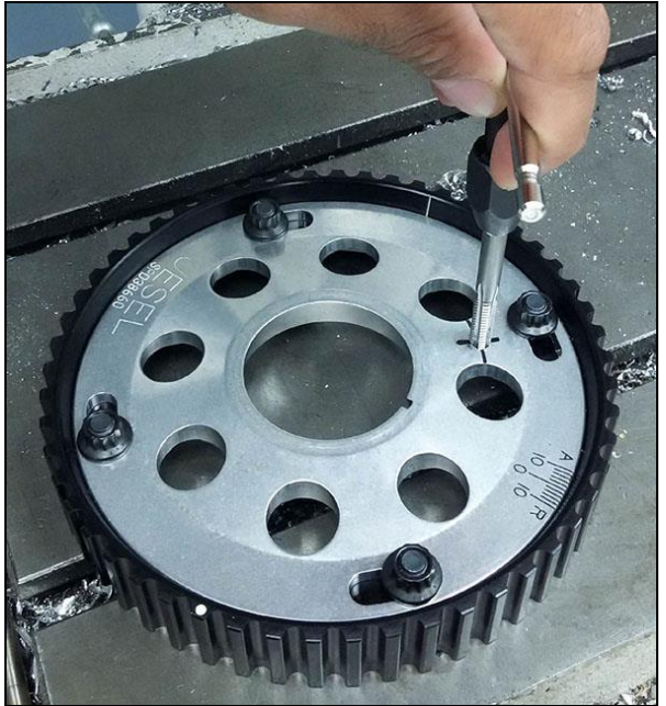
Step 6: Tap hole.